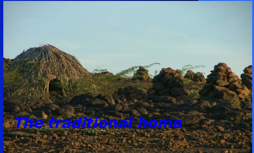
The traditional home