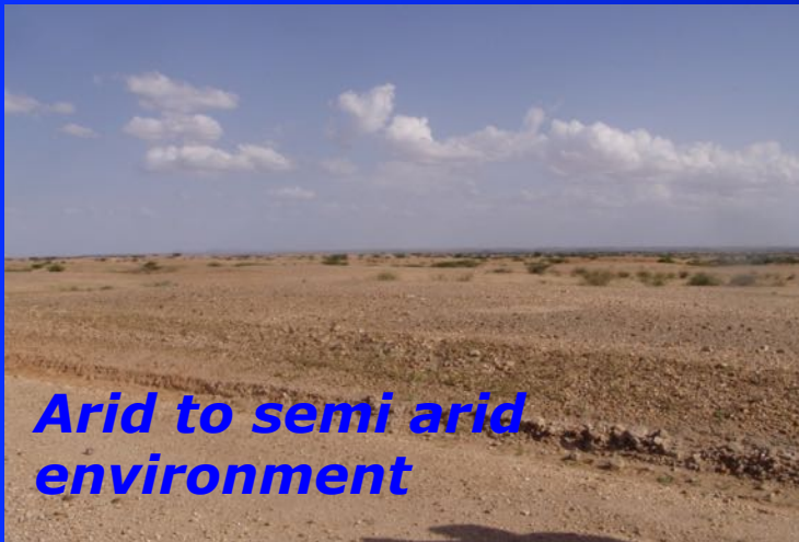
Arid to semi arid environment