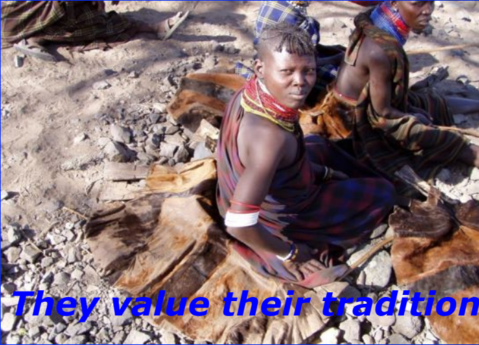
They value their tradition