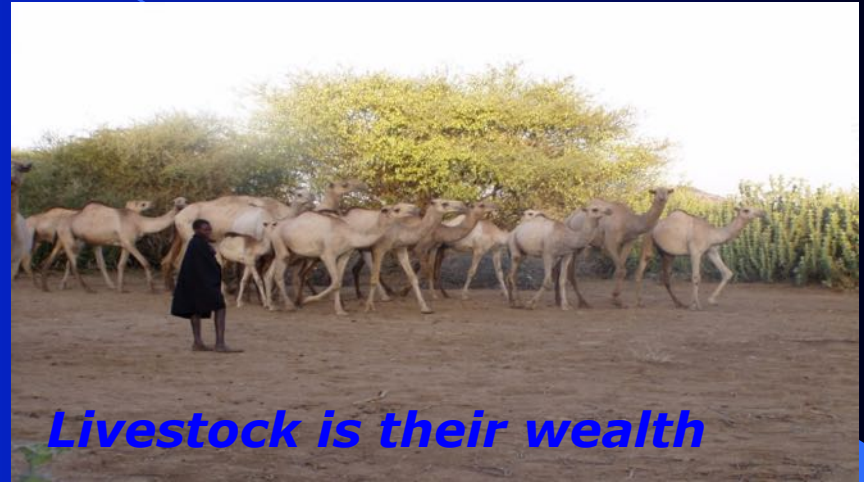
Livestock is their wealth